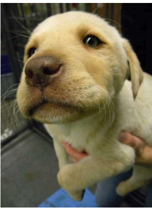
Echo-male lab mix (Look at that face!)

Help Start Over Rover every time you shop: http://www.iGive.com/StartOverRover/?p=19992&jltest=1