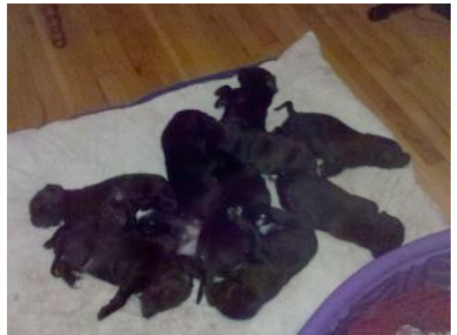
Bessie's new pups born on Black Thursday.

Precious is an amazing large female calico. Something unique about Precious is she does not have a tail! Her owner just recently passed away and Precious is lost without her. Can you please help her out by giving her a loving home? She is up to date on her shots and has been spayed.